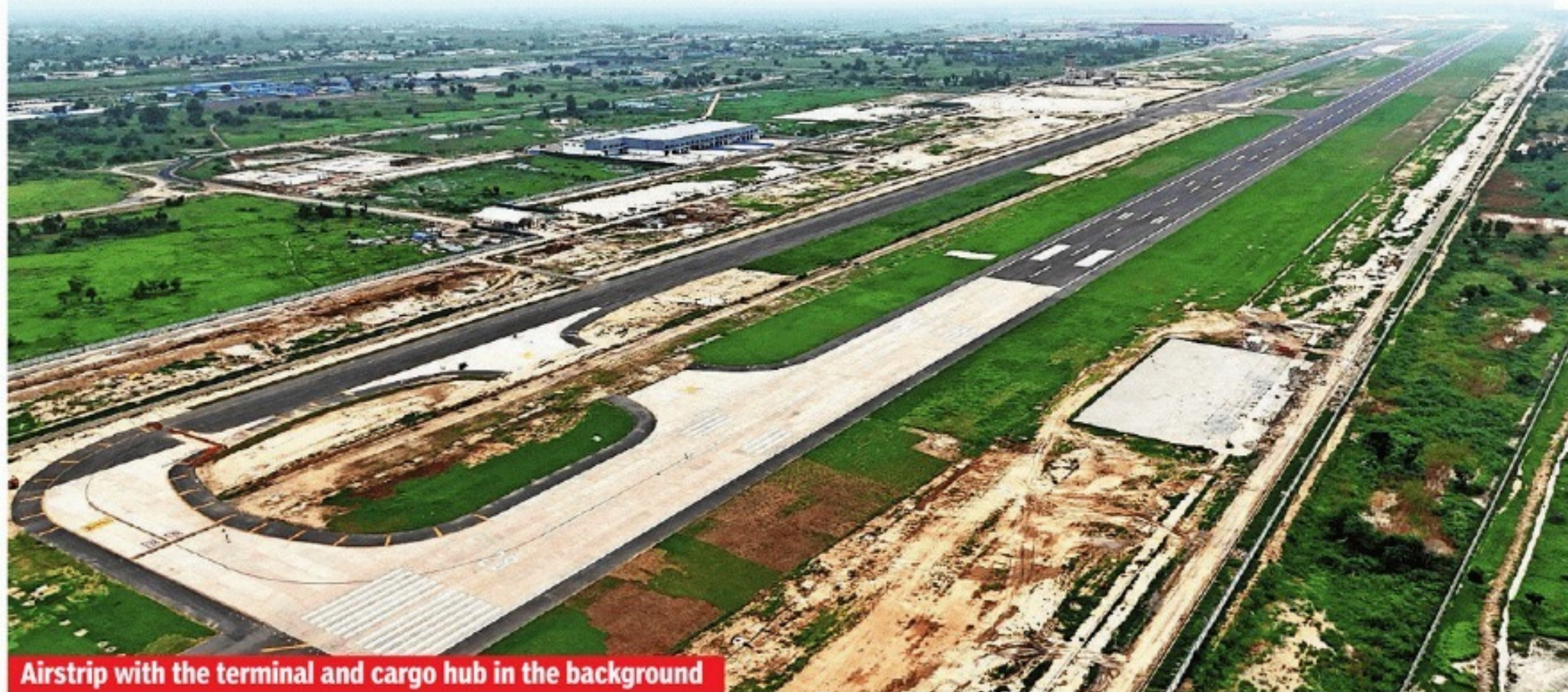
Airstrip with the terminal and cargo hub in the background

Latest visuals show the terminal building, departure lounge, boarding areas, check-in gates, runway, ATC tower and aerobridges at Noida International Airport in Jewar. Poised for inauguration by the year-end and for launch of commercial operations in the first quarter of 2026, it will become Delhi-NCR's second international airport. Delayed by nearly a year, the airport will begin operations with only domestic flights since work on its international terminal is yet to be completed. NIA is likely to receive its aerodrome licence from Directorate General of Civil Aviation (DGCA) this week