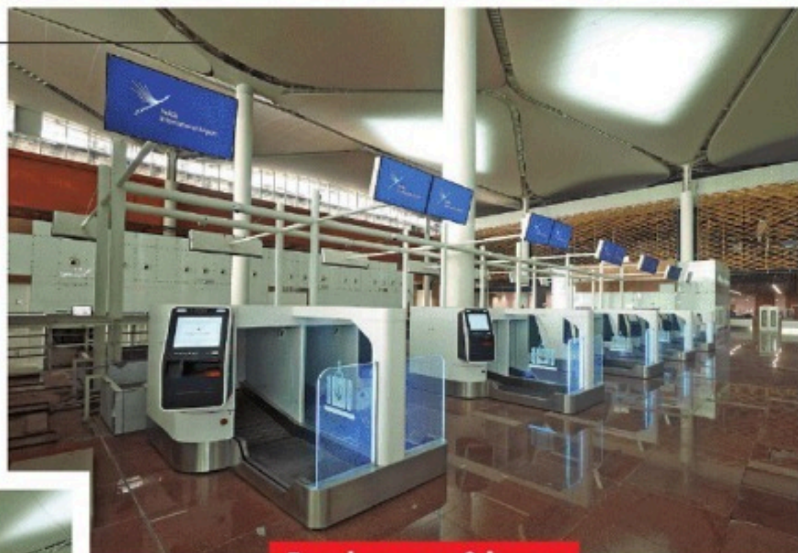
Bag drop area & lounge