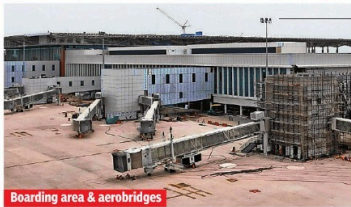
Boarding area & aerobridges